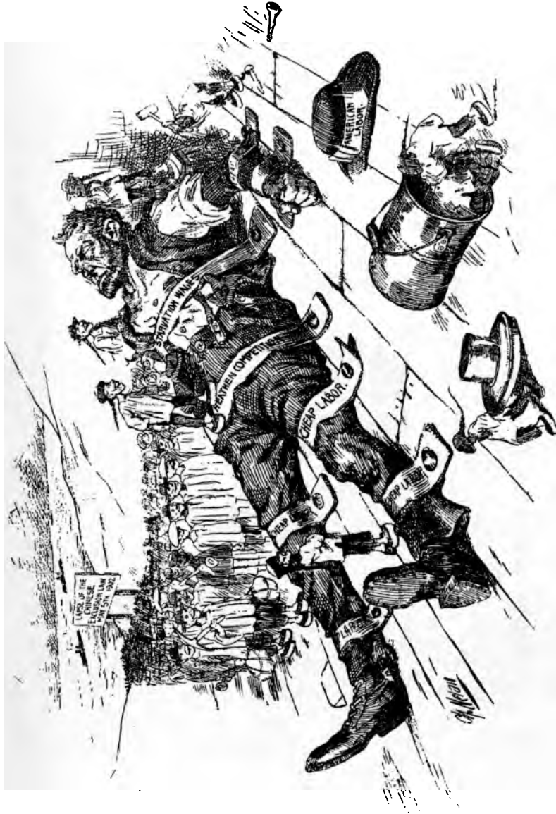
THE AMERICAN GULLIVER AND CHINESE LILLIPUTIANS—SHALL THE LAST SPIKE BE DRIVEN?