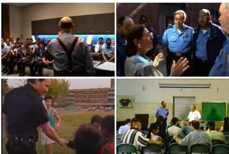
Screenshots from ADL video about "A World of Difference" program, showing how the ADL got cozy with police, who are described in the video as one of the "community organizations."

The ADL has since expanded its trainings for police substantially, while centering cops in its "educational" materials and downplaying the structural racism of US society . In the 1980s, the ADL's " A World of Difference " program, supposedly meant to "combat prejudice" in schools, heavily featured the police (who the ADL absurdly referred to as a "community organization").