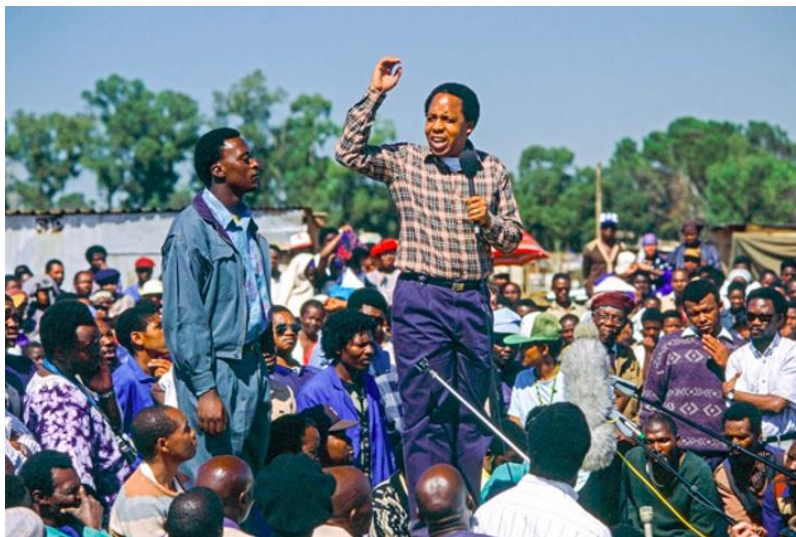
Chris Hani speaking in 1991. An ADL-hired informant spied on Hani while Hani was in California and turned the information over to the Apartheid South African government. Hani was later assassinated in South Africa.