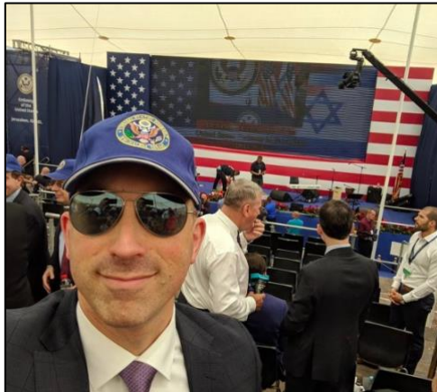
ADL CEO and former Obama administration staffer Jonathan Greenblatt at a ceremony celebrating the opening of US embassy in Jerusalem in 2018. Greenblatt said that “the opening of the United States Embassy in Jerusalem is a historic milestone 2000 years in the making” and that “Jerusalem is Israel’s eternal capital.”

Along with other zionist groups such as the AJC and JCRC, ADL of New England has also mobilized opposition to local BDS efforts, including attempts in 2018 and 2021 to pass BDS-like resolutions in the city council of Cambridge, MA. This is a continuation of an old agenda: the ADL had already declared in 1976 that “the Arab boycott [of Israel] is immoral because it is unfair, discriminatory and destructive of the open American marketplace” and that “there must be laws against it.” Over the last decade, the ADL has played a leading role in the (so far failed) attempts to pass such laws in Massachusetts, which if passed would impose civil and/or criminal penalties on Massachusetts residents that boycott Israel.