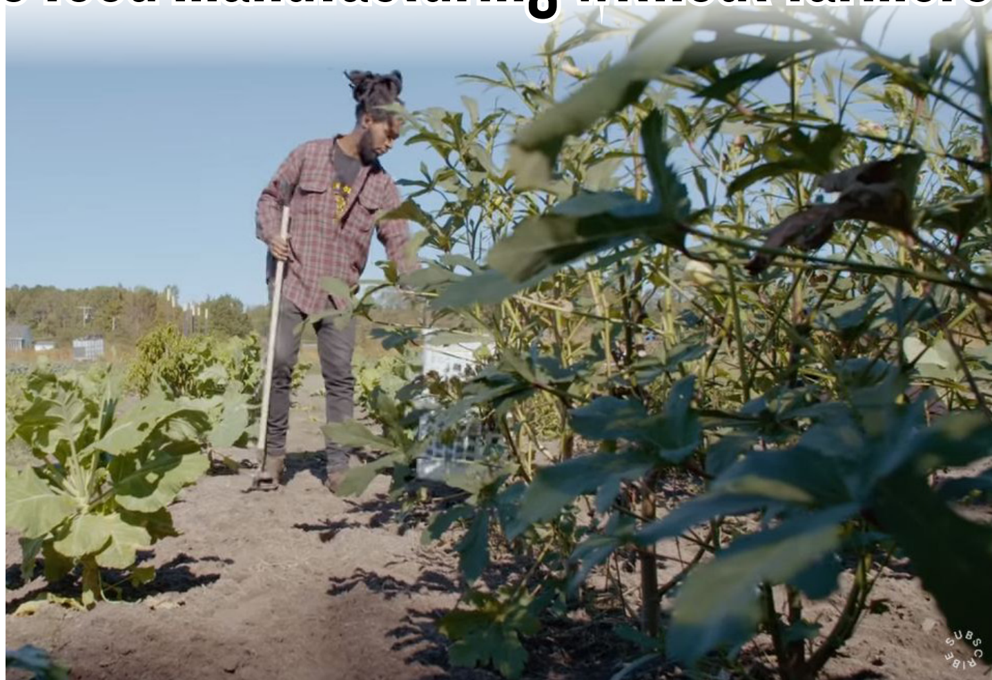
Black farmer