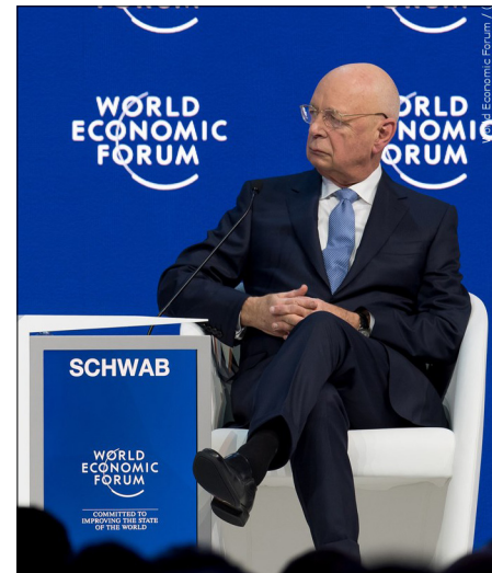
Klaus Schwab