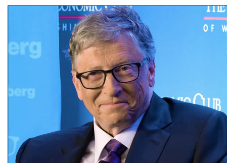
Bill Gates