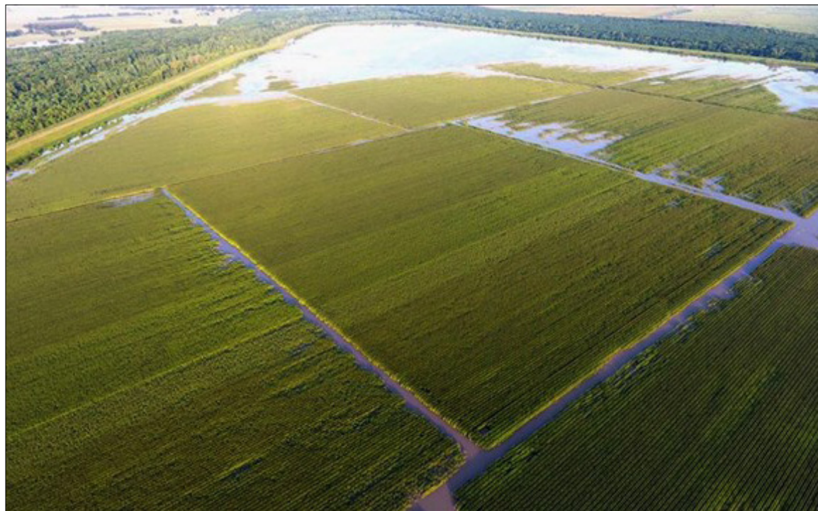
Texas farmland

on the board of a fake meat manufacturer? He is the same Glickman named as the defendant in the Pigford v. Glickman class action lawsuit against the USDA, the federal agency that had racially discriminated against Black farmers in its allocation of farm loans and assistance from 1981 to 1996. What’s more, GOOD Meat is a division of the food technology company Eat Just, Inc., which in 2015 was recognized by Klaus Schwab as a World Economic Forum “Technology Pioneer.” He is the same Schwab that formed a 40-year-plus friendship with Henry A. Kissinger, author of the National Security Study Memorandum 200 (NSSM-200), wherein the Secretary of State argued that for America to control the strategic resources of Third World nations it must actively reduce their populations by millions of lives. The