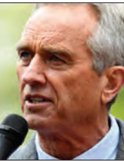
The Real Anthony Fauci Bill Gates, Big Pharma, and the Global War on Democracy and Public Health Robert F. Kennedy Jr. NEW YORK TIMES BESTSELLING AUTHOR Children's Health Defense

“Of course,” he continued, “officials who betrayed the public trust must not be allowed to hold power. I will remove them from their positions and, if laws were broken, my attorney general will prosecute....Just to be clear, I will prosecute any official who engaged in criminal wrongdoing during the pandemic. Corrupt individuals are a small part of the problem. Our agencies have been captured by corporate power, but the vast majority of their staff are decent people. We need to get corporate influence out of all regulatory agencies so that they can serve the people honestly.”