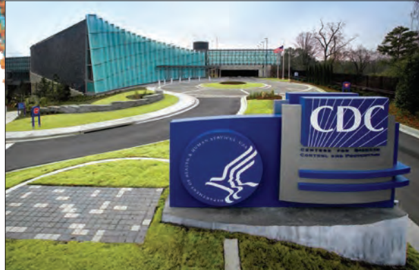
CDC building