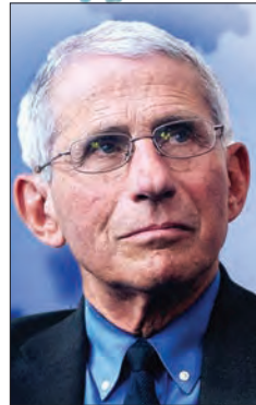
Dr. Anthony Fauci