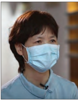
Shi Zhengli