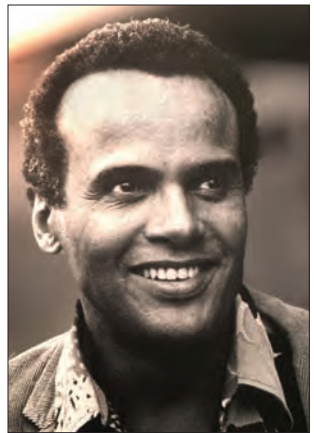
Harry Belafonte

The Honorable Minister Louis Farrakhan has been a faithful warner to the world of the plots and plans of Satan, whose entire aim and objective is to master the Original Man. Satan has given us misleaders who have time after time walked us directly into his traps, degrading us and destroying our future. Not Farrakhan. Here The Minister is described by our dear and recently departed Brother Harry Belafonte in his 1996 interview with Dr. Cornel West: