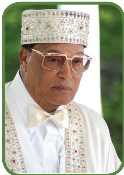
The Honorable Minister Louis Farrakhan