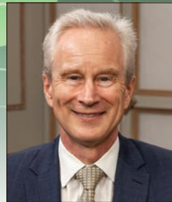
Dr. Peter McCullough