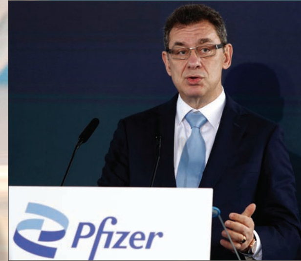
Pfizer CEO Albert Bourla speaks during a ceremony in Thessaloniki, Greece, on Oct. 12, 2021.