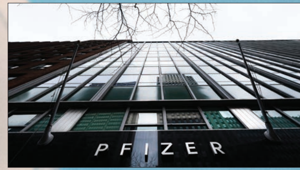
The Pfizer name is displayed at the company's headquarters, Feb. 5, 2021, in New York.