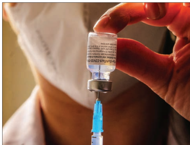
Syringe and vaccine vial

Clearly, the U.S. government promotes and protects these known lawbreakers, but Congress should demand a much wider investigation of possible unlawful activity by Pfizer, or bring in the Indian officials to handle it. Certainly, Pfizer made wildly fraudulent claims about the “safety” and “effectiveness” of its gene-altering injections, because they are neither safe nor effective. And at $20/per dose for a shot that the CDC estimates has now killed at least 33,000 American people, Pfiz-