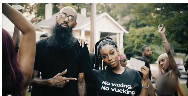
“Vax that thang up” rap video frame.

It did not even bother the “Black influencers” that when white “health authorities” spoke to Black people at all they treated them like children. For 40 years in Tuskegee, Alabama, the “doctors” wouldn't even use medical terminology with their Black victims. They simply “diagnosed” any ailment as