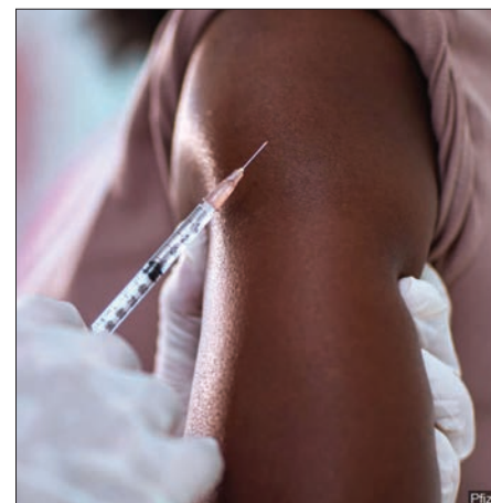
Person receives injection.

and Human Services (HHS) detailing the extensive plans for a propaganda campaign to push the “COVID-19 vaccine.” The still ongoing government plot entails the recruitment of “all entertainment talent and management agencies ... and show producers” to use their platforms and talent to launch a vaccination media extravaganza of unprecedented proportions.