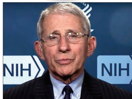
Anthony Fauci