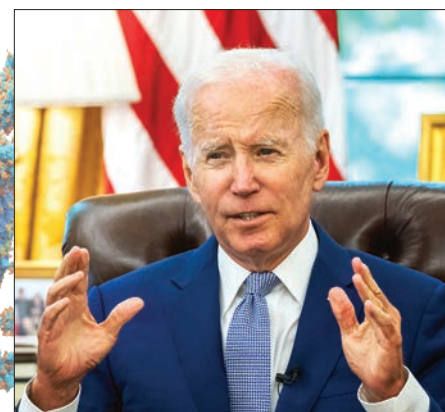
President Joe Biden