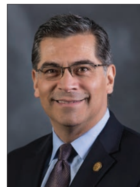
Xavier Becerra

The documents show that the government plot, led by HHS Secretary Xavier Becerra , specifically intends to manipulate Black youth in the slickest way. HHS wanted “young people” on YouTube and Instagram, TikTok, and Snapchat “to create videos of themselves being vaccinated and start a special campaign of funny and/or musical videos ... .” Becerra’s plan includes producing “question-and-answer videos featuring local Black doctors discussing the vaccines, how they work, and why the public should get vaccinated.” Why Becerra targets “Black doctors” and not Asian, Jewish, Italian, white, or obese doctors is not explained. Judicial Watch president Tom Fitton commented, “It seems as if the entire entertainment industry was an agent for the government!”