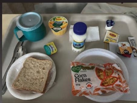
These trays of hospital “meals” served to patients were posted on various social media websites.