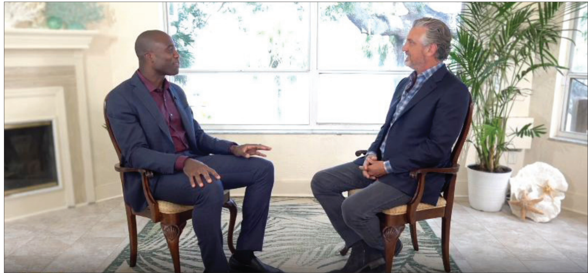
Screenshot from thehighwire.com of medical journalist Del Bigtree interviewing Dr. Joseph Ladapo.