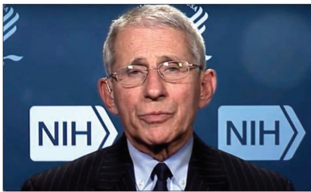
Anthony Fauci