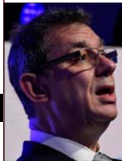
Pfizer CEO Albert Bourla