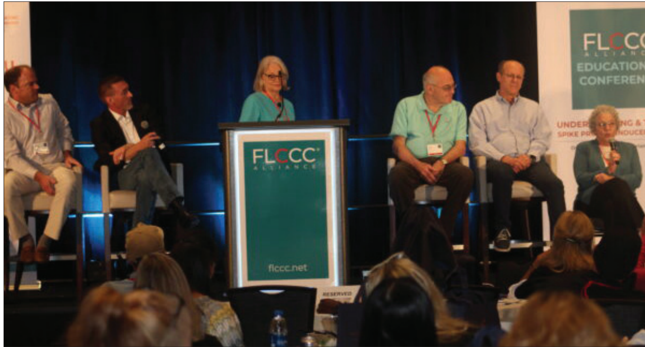
Screenshot from the Oct. 16 FLCCC conference titled, “Understanding and Treating Spike Protein-Induced Diseases.”