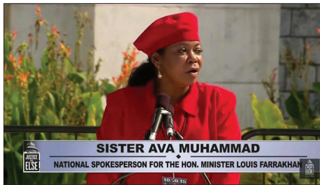
Speaking before the world at "Justice or Else," the 20th Anniversary of the Million Man March in Washington, D.C. in 2015.