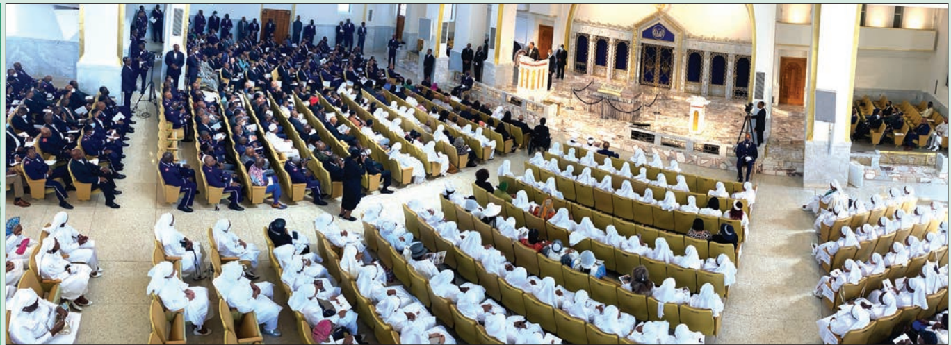
Mosque Maryam was filled to capacity on Sept. 3 for the janazah service honoring the life of Minister Dr. Ava Muhammad, National Spokesperson of the Honorable Minister Louis Farrakhan and the Nation of Islam.