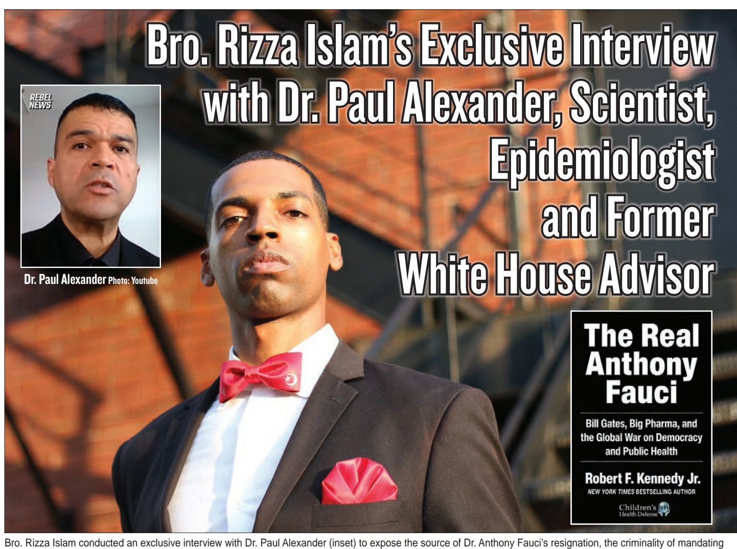
COVID injections for children, the omission of critical data about natural immunity, and more.

"Scientists, as well as legal and medical professionals are seeking out the Nation of Islam specifically, because they continue to search