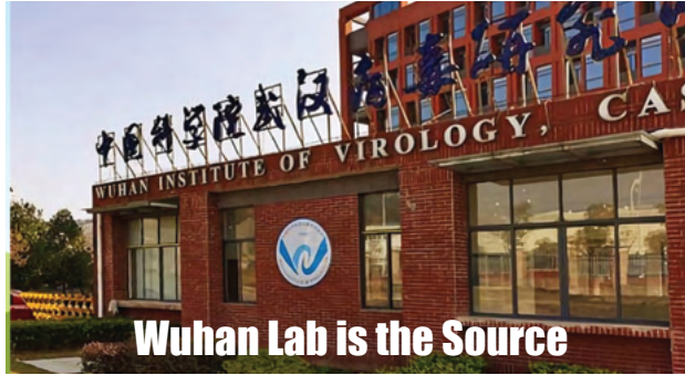
Wuhan Lab is the Source

“But, as I have travelled through the science that underlies this industry, I have gradually learnt to ask questions....I have learnt from biologists that our cells naturally produce viral-like particles without being invaded or infected, both when healthy and sick.”