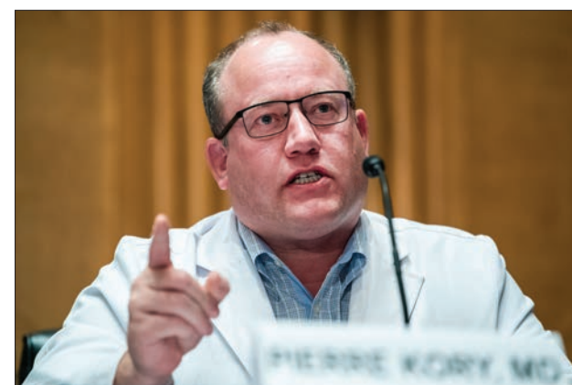
Dr. Pierre Kory testifies during Senate Homeland Security and Governmental Affairs Committee hearing December 8, 2020.