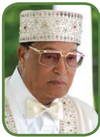
The Honorable Minister Louis Farrakhan

—The Honorable Minister Louis Farrakhan, December 12, 2020