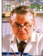
Dr. Luc Montagnier

"In my opinion, the current Israeli government is a gilgul [reincarnation] of Josef Mengele. They have permitted human experimentation of their own people ... . If you see trouble in the Jewish people, you should look at the rabbinic leadership, because if the head is diseased, what do you expect of the body. So, I beg of this [court] to put the interests of [the people of Israel] above politics and anything else that may alter your opinions. I have received death threats, daily death threats. I have risked my life, my career, my financial life, my reputation, almost my family—everything—just to sit here and tell you what I'm telling you.