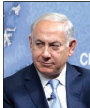
Benjamin Netanyahu

And, yes, your Ministry of Health is lying to you; your statistics are absolutely skewed. If you want to see something real, there's the website called Worldometers.Info [ https://www.worldometers.info ]. Go to "Israel" and you can see at December 20, 2020, there's a huge spike in the curve of death in Israel. You know what happened in Israel, December 20th? National Immunization started. And these are numbers being reported by the Israeli government—they're just too stupid to hide it. There is zero justification, zero justification for using this poison death trap unless you want to sacrifice human beings. I think I'm done."