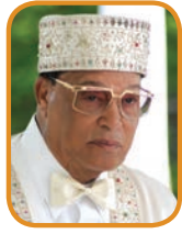
The Honorable Minister Louis Farrakhan

by Ava Muhammad | Student National Spokesperson for the Honorable Minister Louis Farrakhan