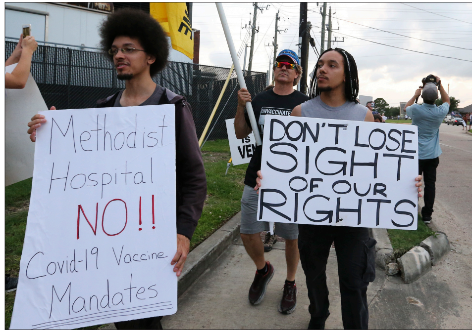
In this June 7, file photo, people march past Houston Methodist Baytown Hospital in Baytown, Texas, to protest against a policy that says hospital employees must get vaccinated against COVID-19 or lose their jobs. A federal judge dismissed their lawsuit, saying if workers don't like the rule, they can go find another job.