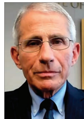
Dr. Anthony Fauci