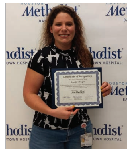
Jennifer Bridges