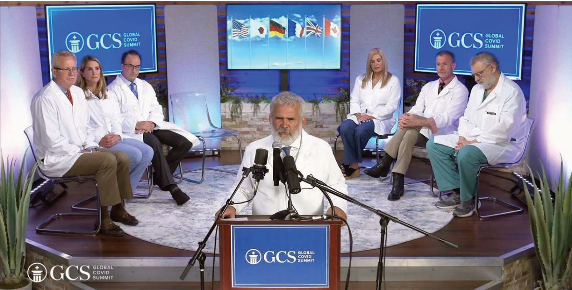
17,000 physicians and medical scientists led by Dr. Robert Malone, declare that the state of medical emergency must be lifted, scientific integrity restored, and crimes against humanity addressed.