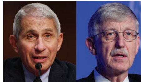
Fauci and Collins. If the payments are royalties and not bribes, why the secrecy?

"We believe there is an unholy conflict of interest inherent at NIH," he said.