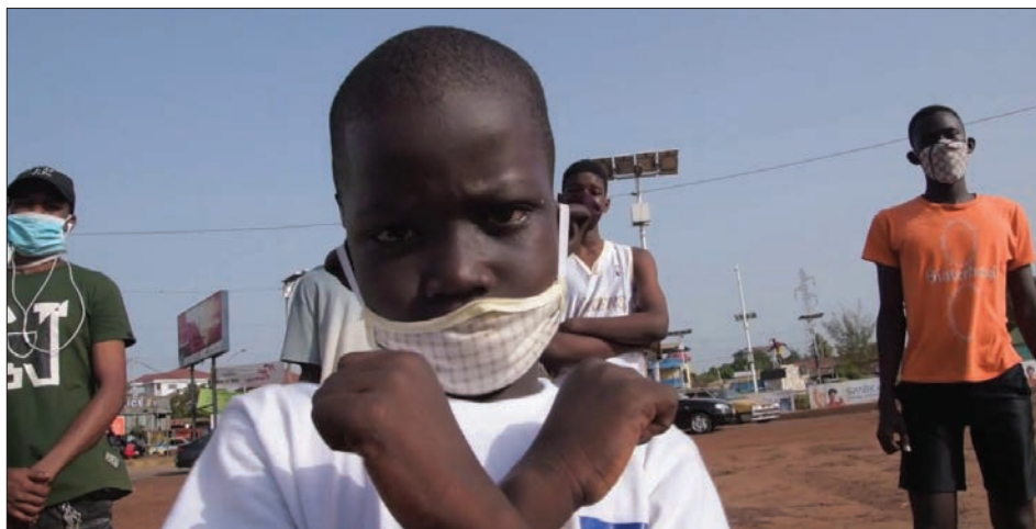
Video frame from presentaion titled, “Collectif Africa Stop Covid-19.”

The scientists of this modern era have genetically modified plants, milk cows and now humans through these latest shots posing as “vaccines.” Moderna and Pfizer-BioNtech mRNA shots were not even patented as “vaccines” but “gene therapies” that instruct our own cells to produce a toxic foreign protein known as the spike protein . The result is that our body's immune cells are killing those of our own cells that are producing this poi-