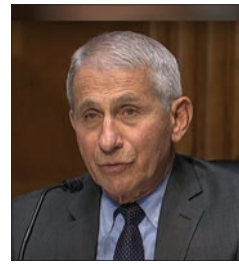
Anthony Fauci

“Then he (the Hon. Elijah Muhammad) said to me, ‘Brother, you can’t fathom the depth of Satan.’ He didn’t use the word devil. ‘You can’t fathom the depth of Satan.’ He never said another word.”