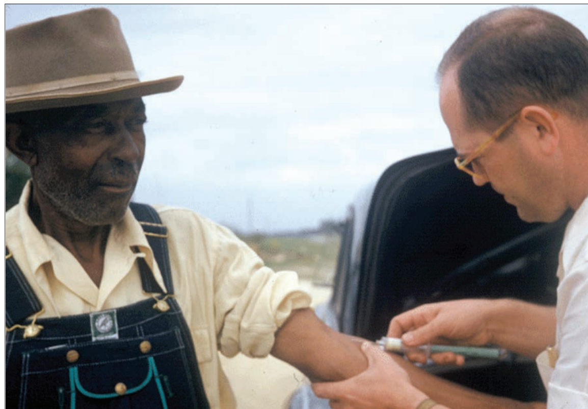
Photograph of participant in the Tuskegee Syphilis Study. Tuskegee Syphilis Study Administrative Records, 1929 - 1972. Record Group 442: Records of the Centers for Disease Control and Prevention, 1921 - 2006

But it is actually worse than that. The crime of Tuskegee was that medical officials withheld a known syphilis cure —penicillin—allowing a deadly and contagious disease to spread among Blacks. And this conspiracy to hide the cure is precisely what made the Tuskegee operation so insidious. “Not only did they withhold treatment,” says the victims’ attorney Fred Gray, “But they sent these men’s names to the various doctors in the area and told them if they came to their office, not