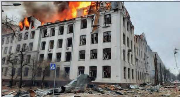
National University after reported shelling in Kharkiv, Ukraine, Mar. 2.

For two years we have been bombarded 24/7 with a fear-mongering media screaming at us about the lethal danger of this COVID-19 “pandemic.” We have been herded to testing stations and vaccination stations to be shot up with not one, not two, but an endless series of experimental gene altering inoculations masquerading as “vaccines,” which wane after a few months, requiring “boosters” to keep us “safe.” But now the big insurance companies have measured a 40%