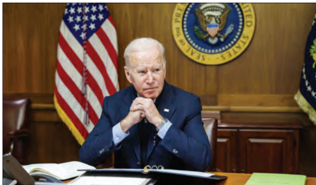
President Biden spoke with President Vladimir Putin prior to the Russian invasion of Ukraine on a diplomatic solution on Feb 12.