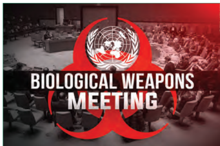
UN Security Council meets on biological weapons in Ukraine.

In order to understand what is happening, one must study scripture in the context of the Teachings of the Honorable Elijah Muhammad. We are at the end of Satan's rule. His power to rule the world by God's Permission ended in 1914. However, the withdrawal of that Permission did not mean he would just give up the power he has wielded for the past