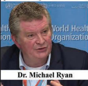
Dr. Michael Ryan

prise” COVID-19 “pandemic,” is apparently why Dr. Anthony Fauci could make this now infamous “prediction” in his “Pandemic Preparedness in the Next Administration” speech on Jan. 10, 2017, shortly before Trump’s inauguration: “The thing we’re extraordinarily confident about is that we’re going to see [a pandemic] in the next few years.”