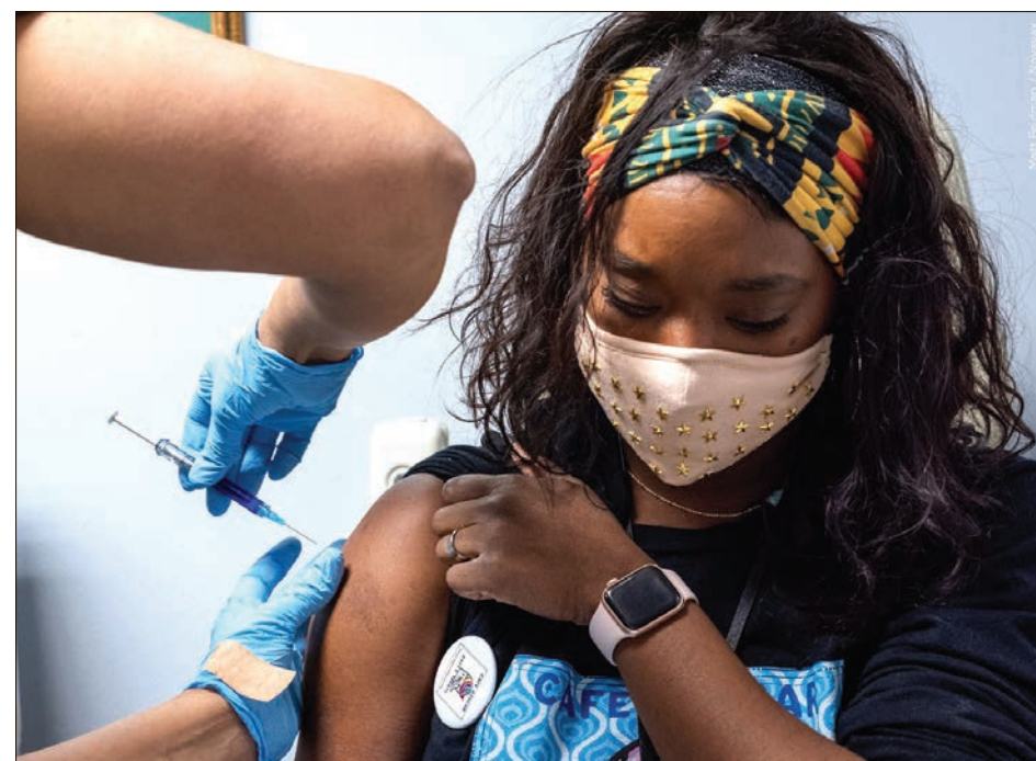
Girl receives injection.