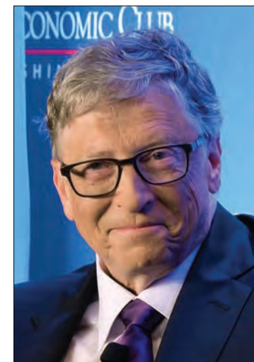
Bill Gates

has been shifted from locally grown grains, fruits and vegetables. Globally, one in five deaths are caused by diets with too low amounts of whole grains, fruit, nuts and seeds compared to diets with high levels of trans fats, sugary drinks, and high levels of red and processed meats. Diets high in sodium, low in whole grains, and low in fruit together accounted for more than half of all diet-related deaths globally in 2017.