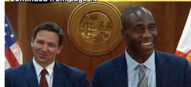
Florida's Gov. Ron DeSantis and the state's surgeon general Dr. Joseph Ladapo