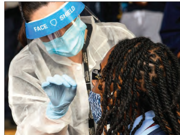
Patient getting tested for COVID-19.

Why, then, are millions of people, vaccinated and unvaccinated, required to be tested over and over and over again? Beyond the manufactured case numbers, the test itself is deadly. The cotton-tipped swabs are all sterilized with ethylene oxide , a cancer-causing substance. Go to cancer.gov. According to the same U.S. government that is forcing the vaccine on everyone, including children (who have virtually zero chance of getting Covid-19), ethylene oxide is a colorless gas used to produce other chemicals, such as antifreeze. It is also used as a pesticide and a sterilizing agent. It has a strong ability