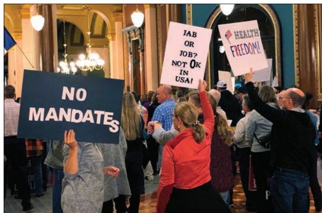
Protesters gather at the Iowa Capitol in Des Moines, Iowa, on Oct. 28, to push the Iowa Legislature to pass a bill that would prohibit vaccine mandates from being imposed on employees in Iowa. Informed Choice Iowa, a group opposing vaccine and mask mandates, held the rally as lawmakers convened a special session of the legislature and unveiled a bill that provides for vaccine mandate exemptions and required unemployment benefits for workers forced out of a job for refusing a vaccine.

The intelligence agencies include the CIA, the National Reconnaissance Office, “which operates U.S. spy satellites,” and other secret government operations that collect information, fight covert wars, engage in dirty tricks and are the secret hand of the U.S. and its ugliest operations. They are the universal snoopers