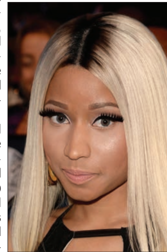
Nicki Minaj