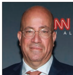
CNN News president Jeff Zucker