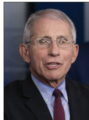
Dr. Anthony Fauci

Next week: Part 2: Fauci's Disastrous COVID Policies