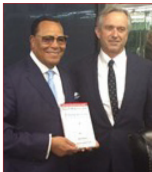
The Honorable Minister Louis Farrakhan and Robert F. Kennedy, Jr.

In 2015 attorney and health advocate Robert F. Kennedy, Jr., met with the Honorable Minister Louis Farrakhan about evidence he had uncovered that high concentrations of mercury in the standard vaccines were causing irreparable harm to Black children ... these tainted vaccines were likely the cause of rising levels of autism and disease in the Black community. Of that meeting Minister Farrakhan said, "Some of us are afraid, but Mr. Kennedy found his way to our door." This effort by Mr. Kennedy to alert Blacks to the dangers of toxic vaccines very likely saved thousands from untold suffering at the hands of unethical vaccine makers.