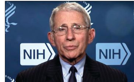
Dr. Anthony Fauci

Dr. Fauci encouraged his own canonization and the disturbing inquisition against his blasphemous critics. In a June 9, 2021 je suis l'état interview, he pronounced that Americans who questioned his statements were, per se, anti-science. "Attacks on me," he explained, "quite frankly, are attacks on science." The sentiment he expressed reminds us that blind faith in authority is a function of religion, not science. Science, like democracy, flourishes on skepticism toward official orthodoxies. Dr. Fauci's schoolboy scorn for citation and his acknowledgement to the New York Times that he had twice lied to Americans to promote his agendas—on masks and herd immunity—raised the prospect that some of his other "scientific" assertions were, likewise, noble lies to a credulous public he believes is unworthy of self-determination.