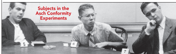
Subjects in the Asch Conformity Experiments