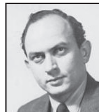
Dr. Solomon Asch

That is why every dissenting voice must be violently silenced. If one person cries, “The vaccine is a fraud,” people will see the naked truth. And that can’t be allowed.