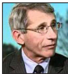
[Read Kennedy’s THE REAL ANTHONY FAUCI: BILL GATES, BIG PHARMA, AND THE GLOBAL WAR ON DEMOCRACY AND PUBLIC HEALTH]

“Medicines were available against COVID—inexpensive, safe medicines—that would have prevented hundreds of thousands of hospitalizations and saved as many lives if only we’d used them in this country. But Dr. Fauci and his Pharma collaborators deliberately suppressed those treatments in service to their single-minded objective—making America await salvation from their novel, multi-billion dollar vaccines.”