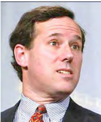
Sen. Rick Santorum (R-PA)

wrote a column for the Virginia Voice shortly before Obama’s election questioning whether Obama would change the American flag to include the Islamic symbol or divert more aid to Africa so “the Obama family there can skim enough to allow them to free their goats and live the American Dream.”