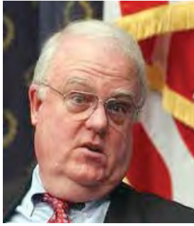
U.S. Rep. Jim Sensenbrenner , R-Wisconsin

told church members at a Christmas bazaar that our first lady has a “big butt.” He was heard complaining loudly at Reagan National Airport in Washington that Michelle Obama should practice what she preaches with her “Let’s Move” campaign, promoting healthy eating and exercise habits. “She lectures us on eating right while she has a large posterior herself,” he complained on the phone.