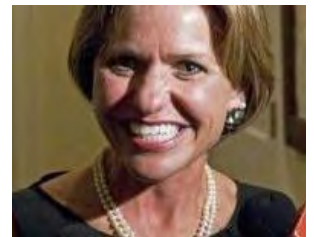
U.S. Rep. Lynn Jenkins , R-Kan.

told a public forum: “Republicans are struggling right now to find the great white hope.”