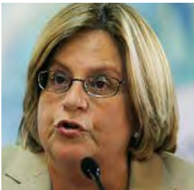
Cong. Ileana Ros-Lehtinen , leading Rep. on Foreign Affairs Comm.

The Obama Administration "undermine(s) both our allies and the peace process, while encouraging the enemies of America and Israel alike."