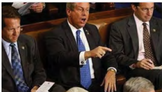
Republican Cong. Joe Wilson

shouted "He Lies!" at Obama's speech to Congress (Sept 9, 2009).