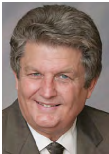
Dean Grose , the mayor of Los Alamitos, California

sent an e-mail showing a watermelon patch growing on the White House lawn, and the caption "No Easter egg hunt this year."