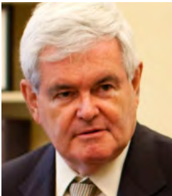
Presidential candidate Newt Gingrich

said that Obama's policies are "a very serious threat to our way of life." He added that "The secular socialist machine represents as great a threat to America as Nazi Germany or the Soviet Union once did."