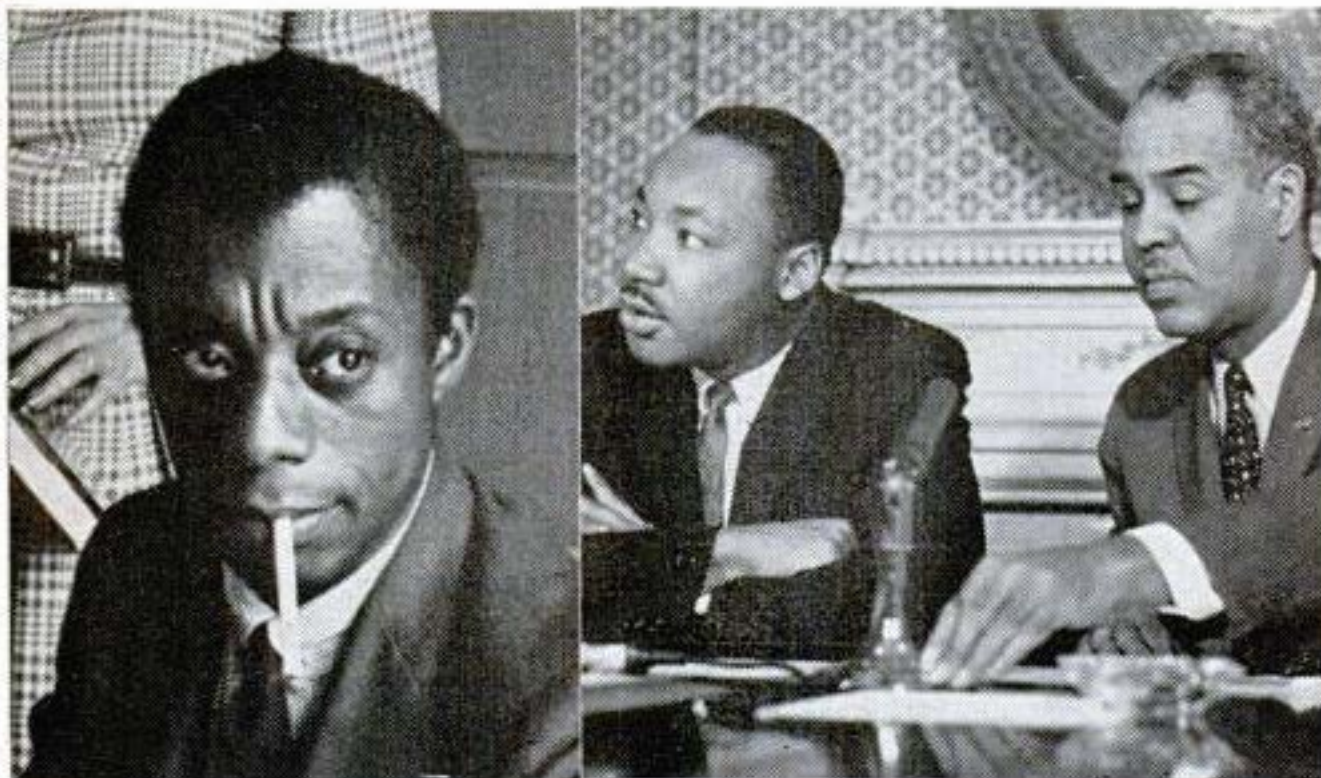
Baldwin (l) and Dr. King agree on Xmas boycott, but approach it differently; but NAACP's Wilkins won't lock out Santa.

Dr. Martin Luther King Jr., wants a "sacrificial Christmas," commemorating the deaths of six children killed in