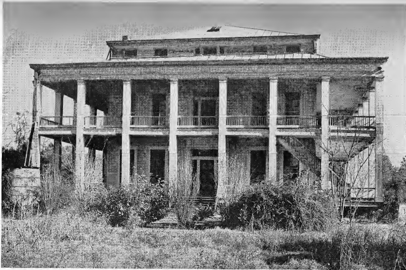
JUDAH P. BENJAMIN'S PLANTATION HOUSE AT BELLECHASSE